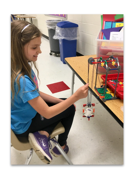
Open to All Interested Students